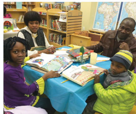
New books for students and families to enjoy